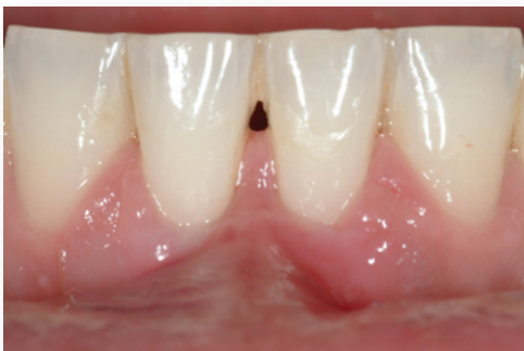
Daily Periogenix use Two weeks post-surgery