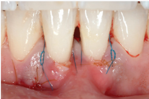
Immediately post-dental surgery